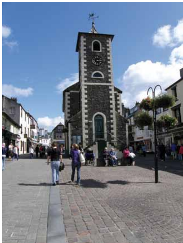
Street paving in Keswick

The most positive were for photographs of Victoria Square (with a view of the Raven Hotel) the Town Hall area of the High Street, and the square in Keswick. The photograph here, focusing on the paving, is one of the latter.