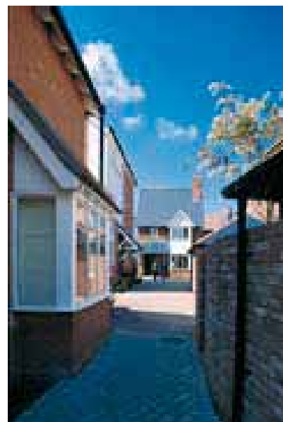
West Malling housing development