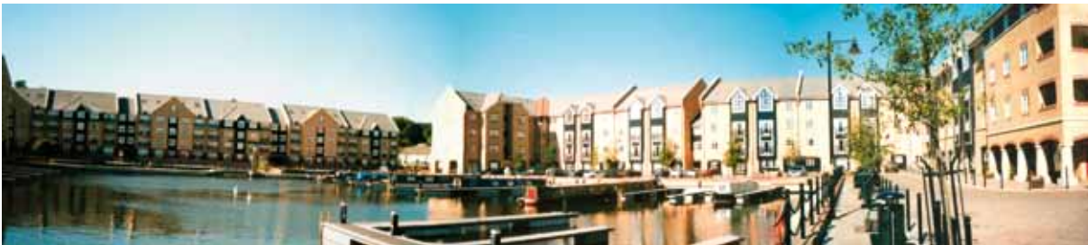
Hemel Hempstead canal basin

The examples that produced pronounced negative reactions were photographs of the Mail Box and Brindley Place, Birmingham, an award winning canal side dance school, and a modern industrial river side building in Berlin. Two other examples that did not impress (but not so emphatically) were of the Diglis Basin development in Worcester.